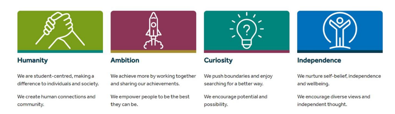
Figure 1 Our PMU values that underpin the strategy.