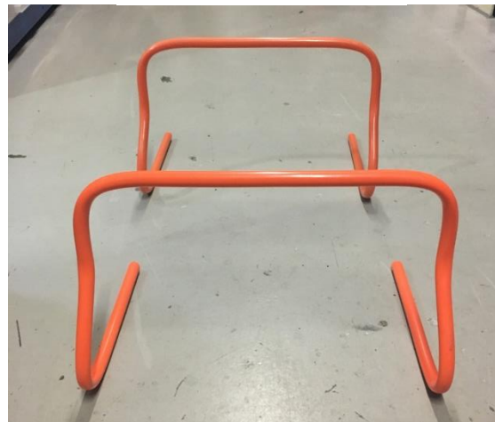
Tall SAQ Hurdles