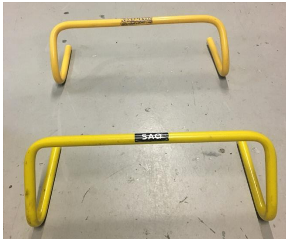
Short SAQ Hurdles